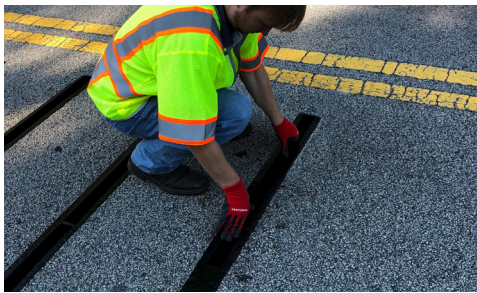
RibLine™ Rumble Bars