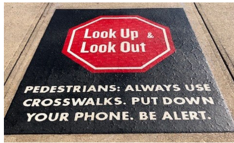
OPTDSIGN™ Preformed Thermoplastic